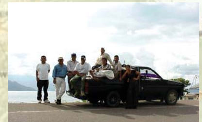
above: A group from Lago de Yojoa that heard the Message from the radio broadcast.