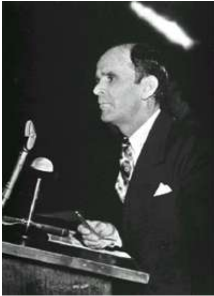
The Pillar of Fire above Bro. Branham's head.