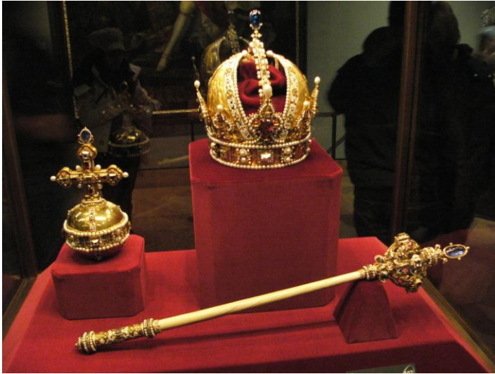
Symbol of Authority, Divine Power, Dominion

1:8 But unto the Son he saith , Thy throne , O God, is for ever and ever: a sceptre of righteousness is the sceptre of thy kingdom.