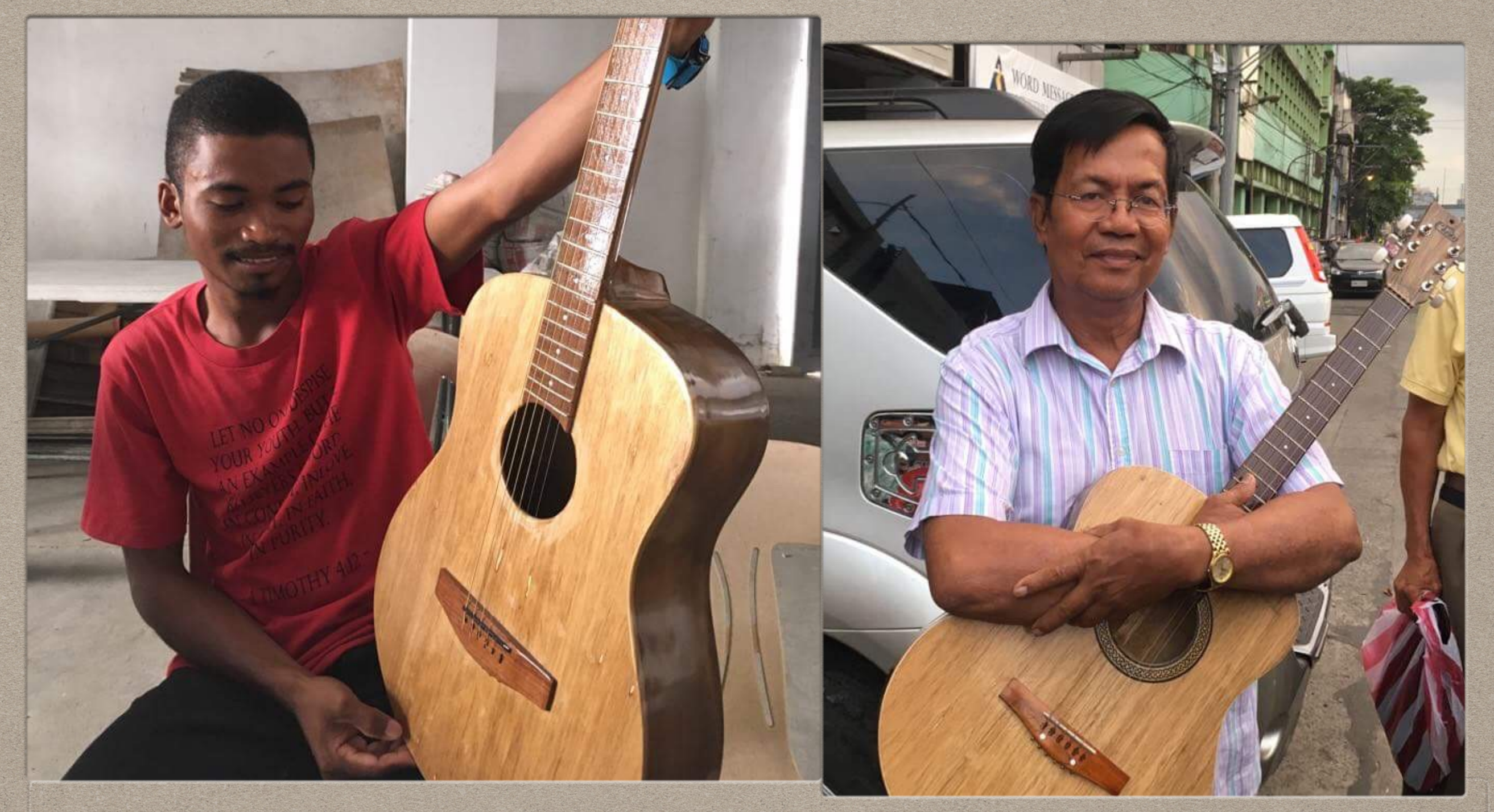
HAPPY RECIPIENTS OF GUITARS