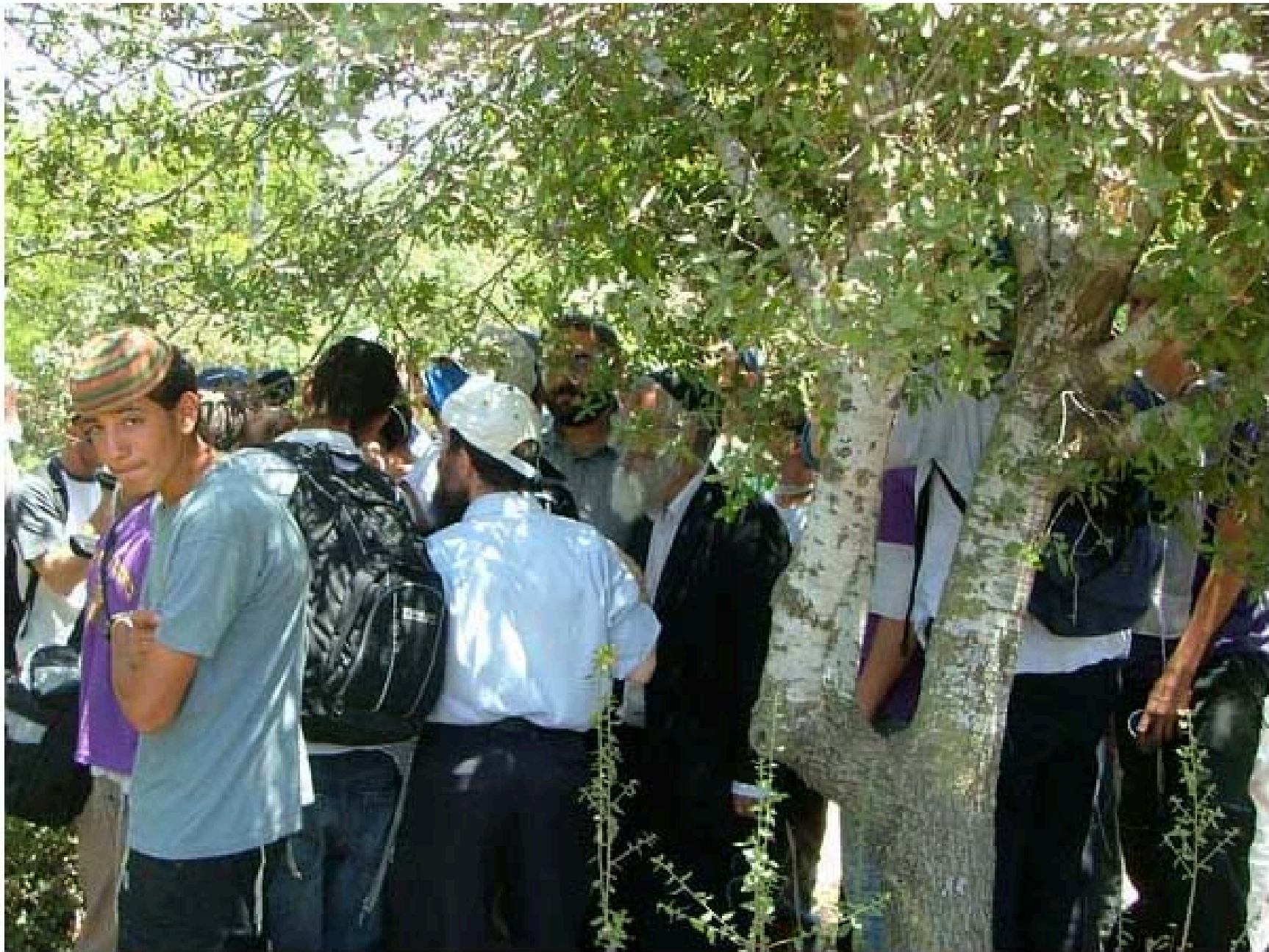
Harvesting the tola'at shani among the oaks.