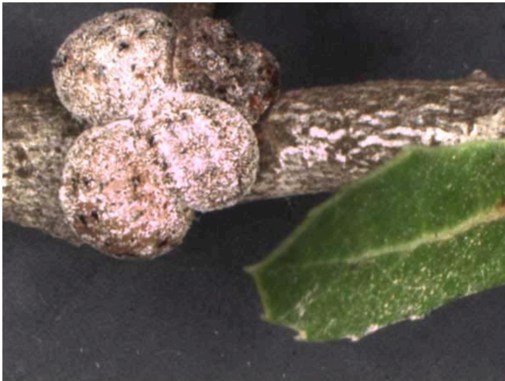
A magnified photograph of the tola'at shani.