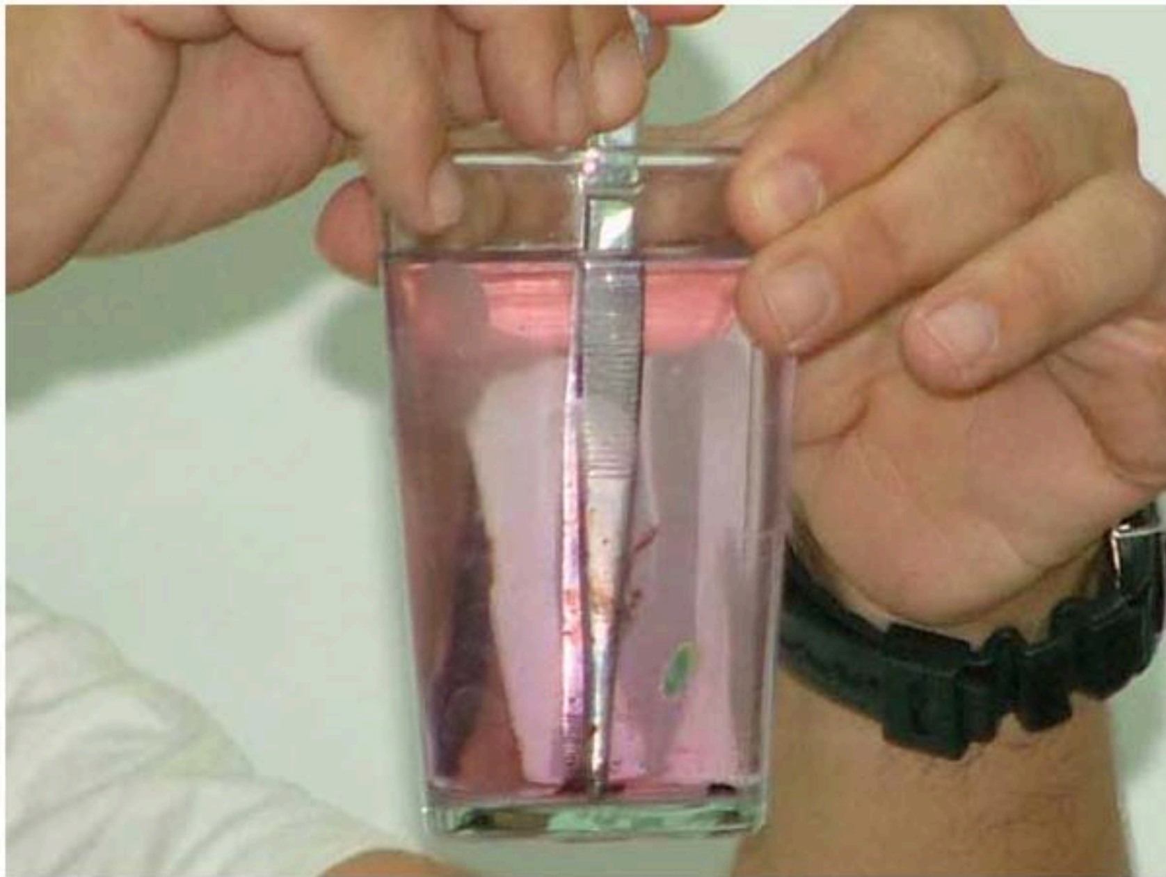
The tola'ah begins to dissolve.