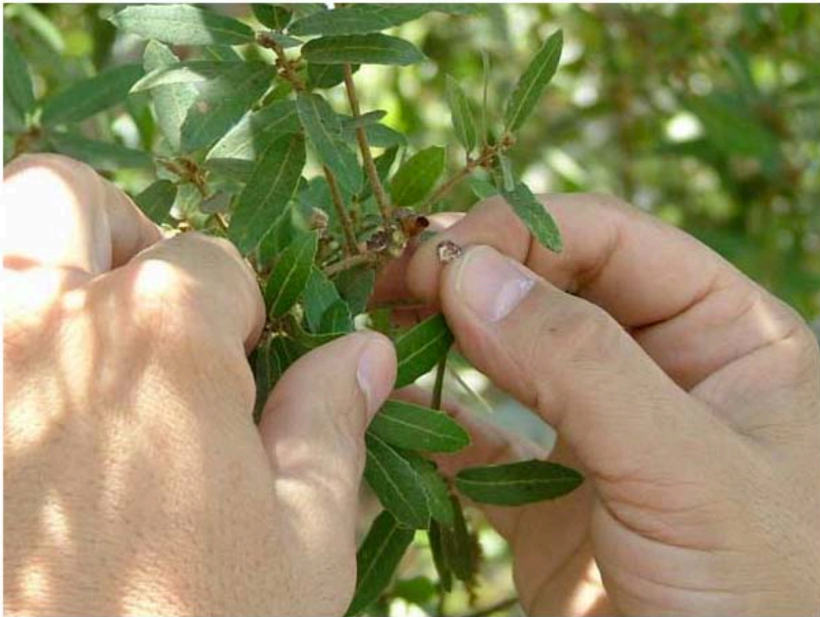
The tola'ah is carefully removed from the branch.