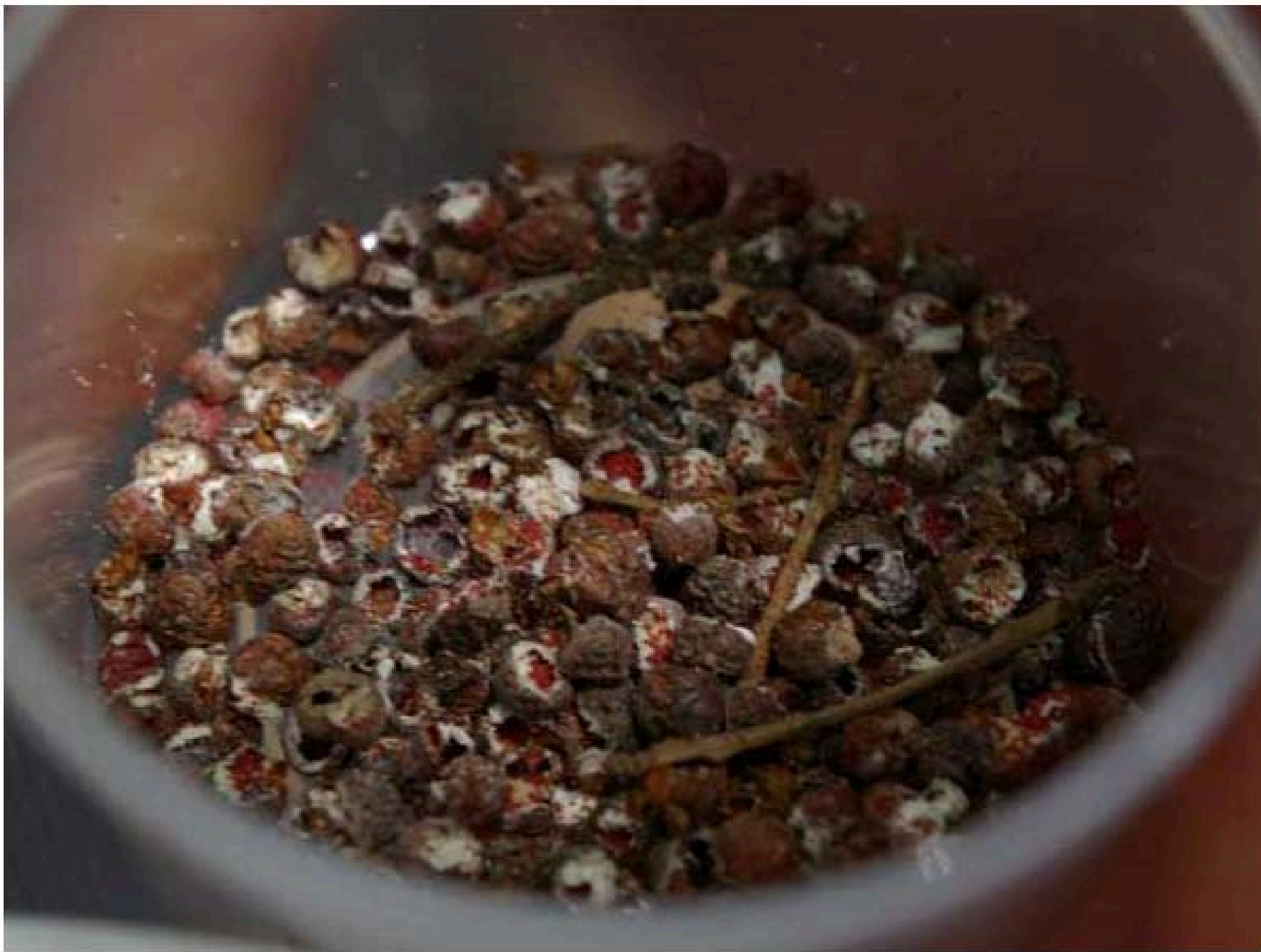
Freshly gathered tola'ot. The red "filling" are the eggs.