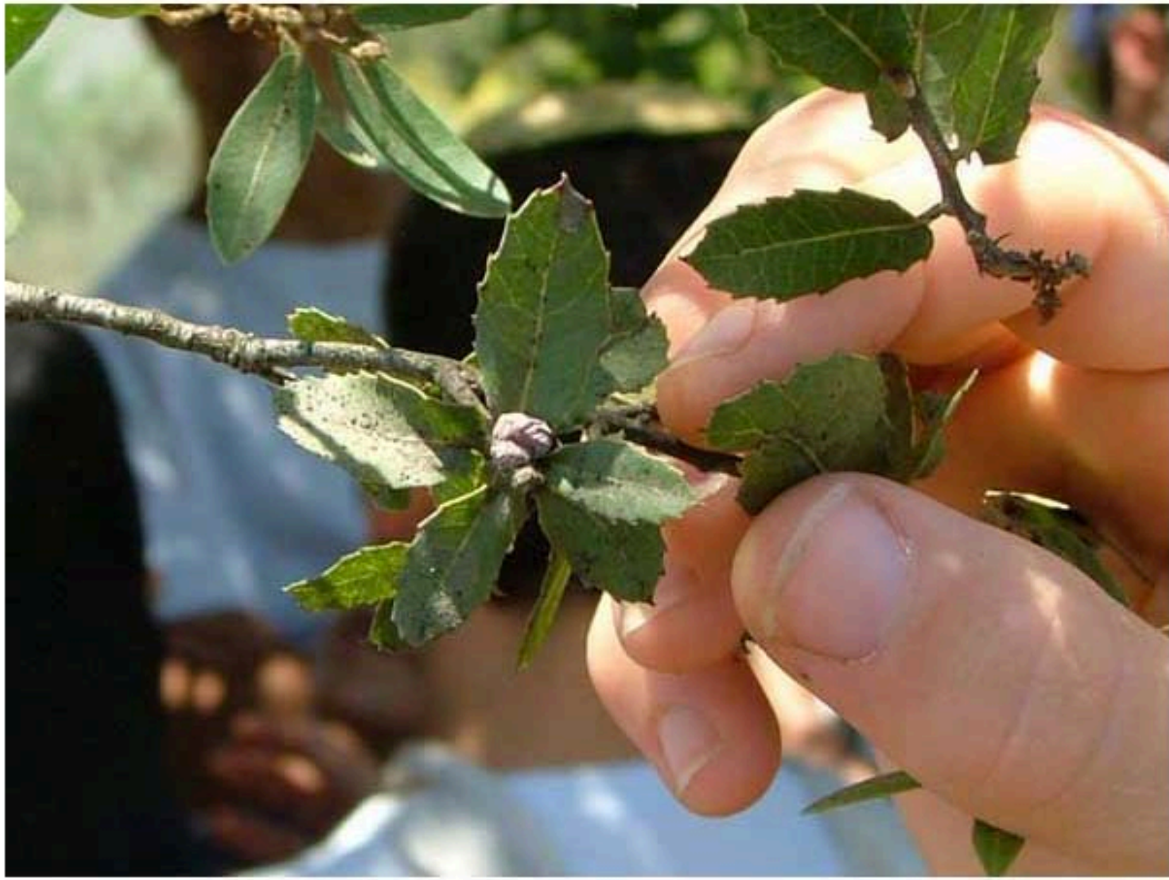
The female tola'ah attached to a branch.