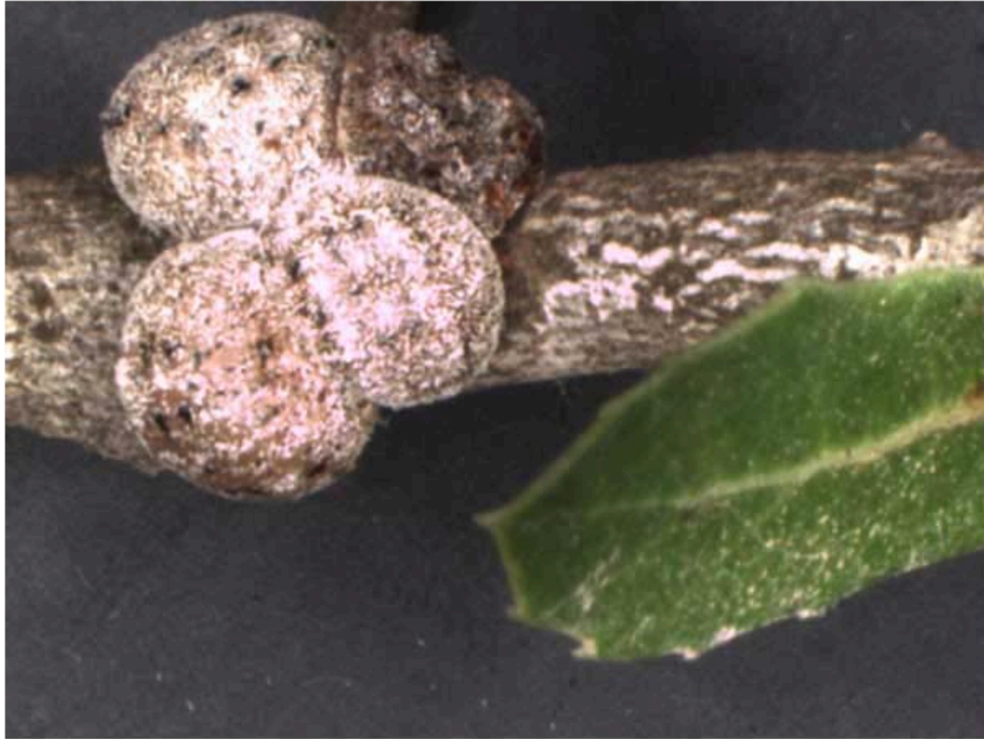
A magnified photograph of the tola'at shani.