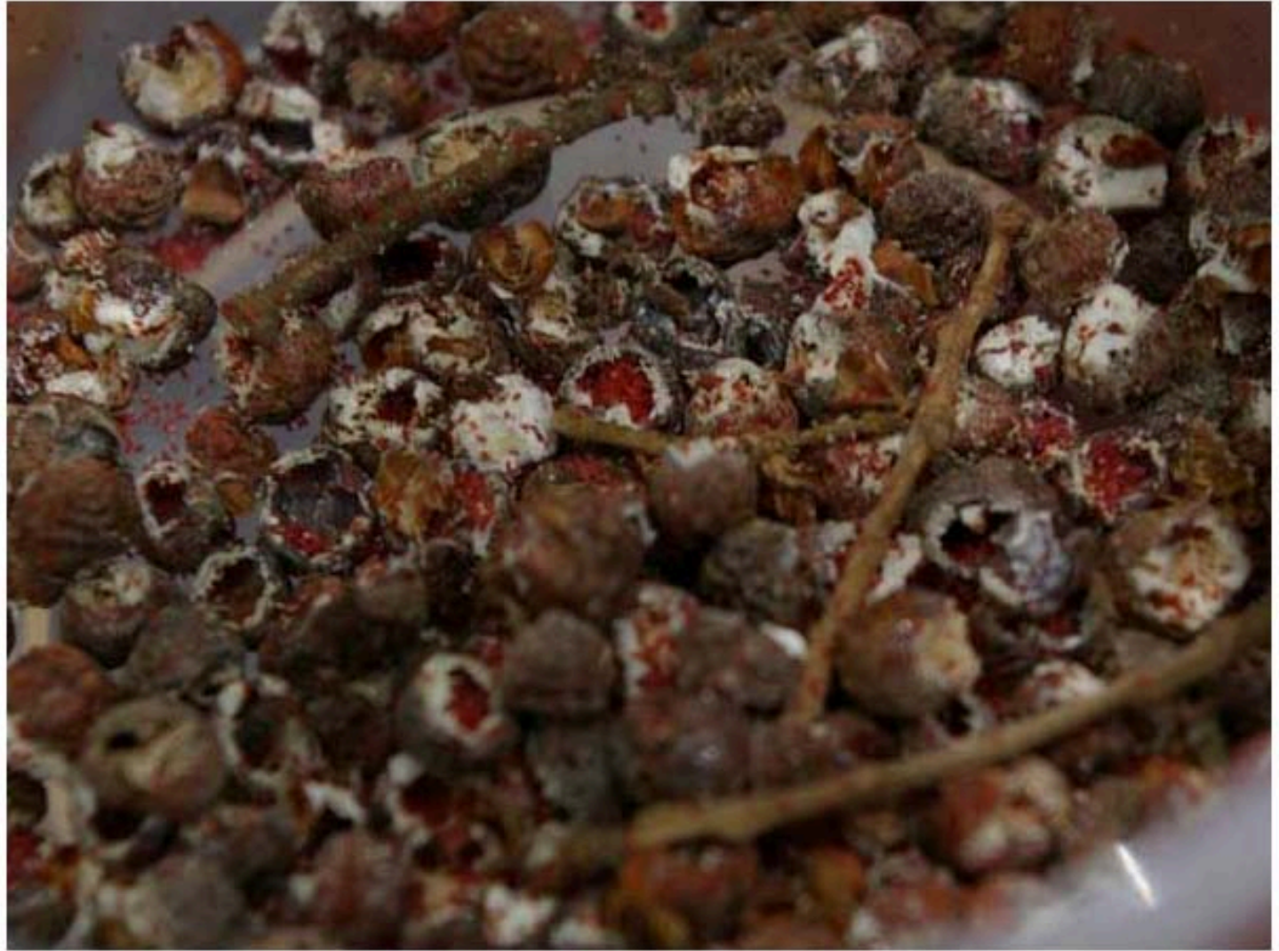
A magnified photograph of the tola'at shani.