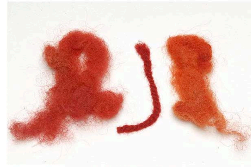
A sample of wool previously dyed by Professor Amar, using the tola'at shani.

After the mother dying to birth the family, for a period of three days the worm can be scraped from the tree and the crimson gel can be used to make a dye. That dye was the same which was used in the tabernacle and in the garments of the High Priest .