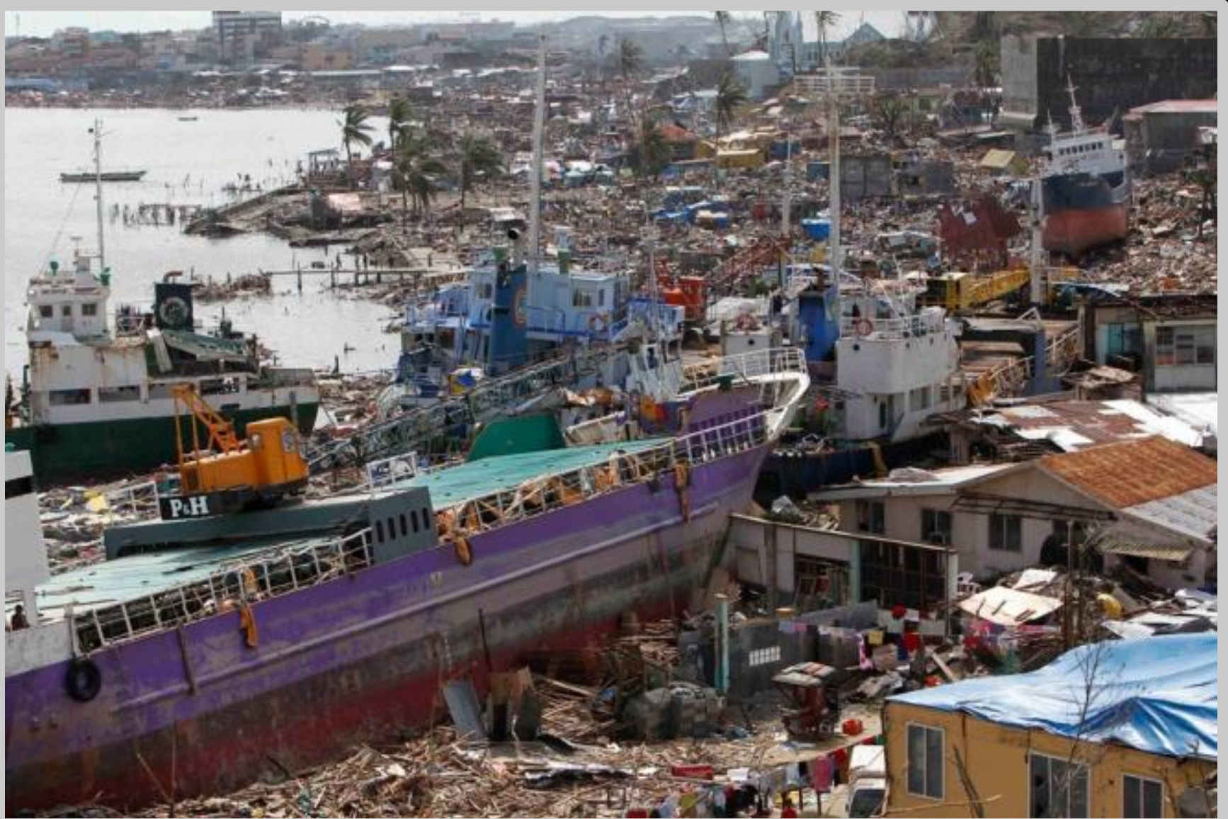
CARGO SHIPS WASHED ASHORE