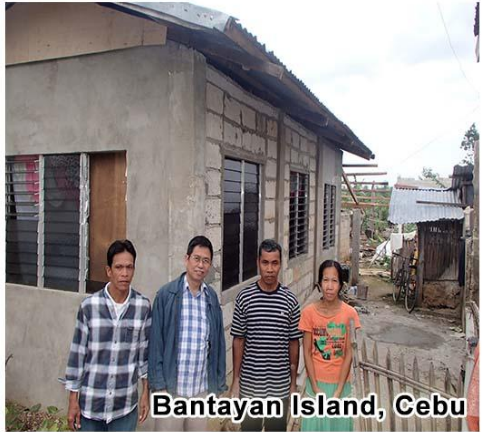
Bantayan Island, Cebu